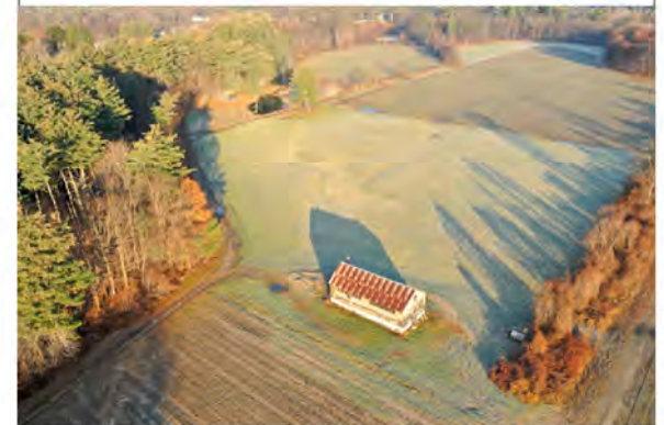
Bean Farm