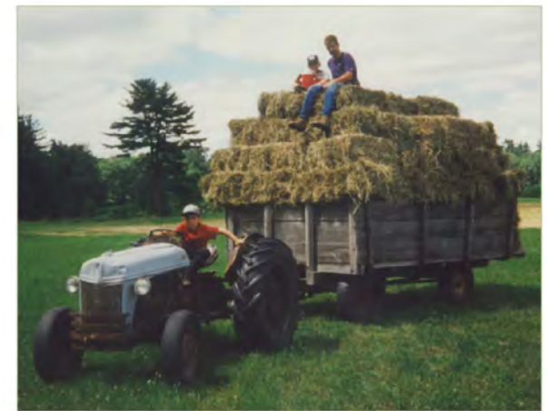
Five generations of Beans farmed the land.