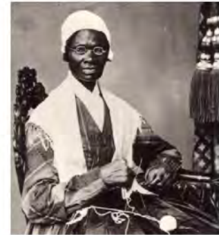
The Bean and Allard farmland has been tilled continuously throughout Northampton's history. Sojourner Truth and other abolitionists grew diverse crops on this site in the 1840s.

Only Weeks Remain to Help! Grow Food Northampton must bring all funds to the closing on January 31, 2011. Please send your tax-deductible contribution today!